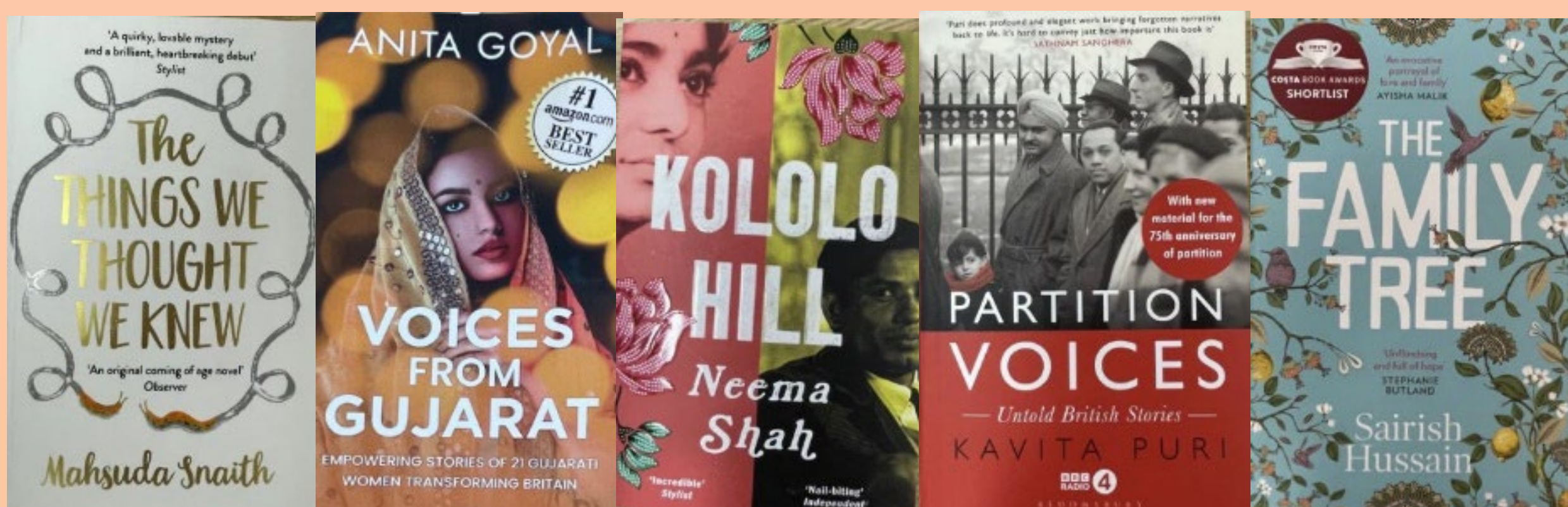
The books included in our SAHM event