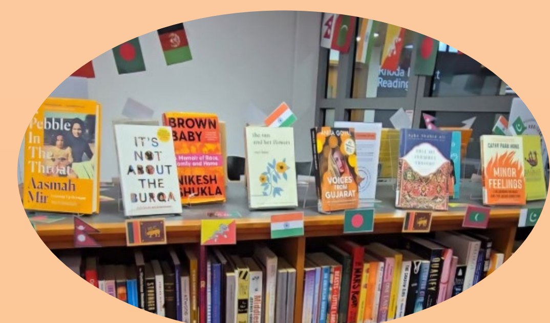
Our book display in our Reading Lounge