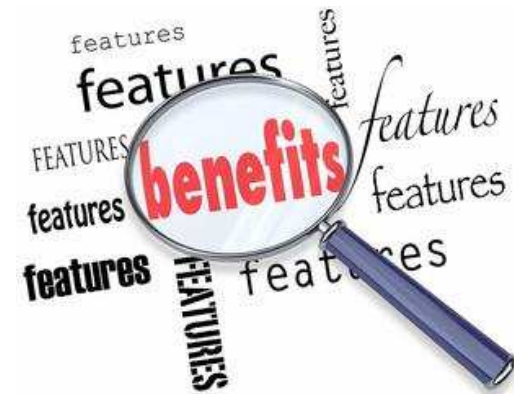
Image used under Creative Commons from http://region1rttt.ncdpi.wikispaces.net/Webquests